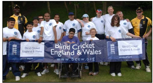
BCBS players join forces with volunteers from London Metro against the Lashings World XI

Lashings stalwart Richie Richardson said: "I played against some bowlers who were very difficult to play in my career, like Wasim Akram and Waqar Younis, but this was something completely different for me, it's a complete step into the unknown."